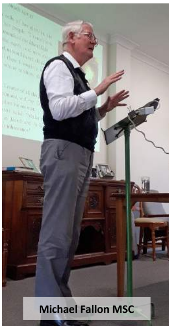
Michael Fallon MSC