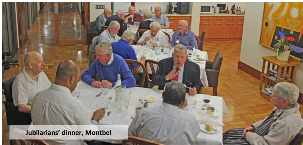
Jubilarians' dinner, Montbel