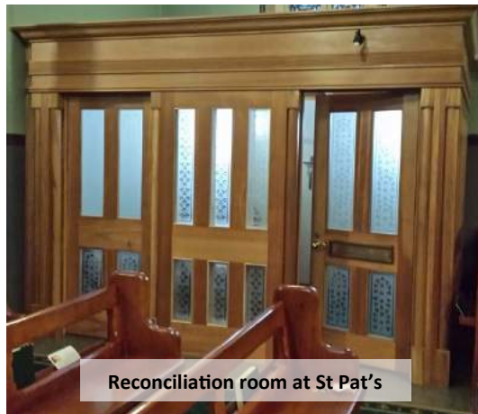
Reconciliation room at St Pat's