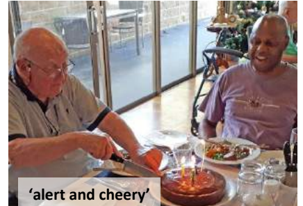
'alert and cheery'